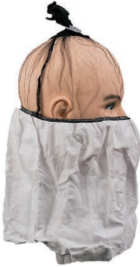
Photo 2 – The TranZport Hood™ from Safariland® utilizes a bacteria filtering, medical grade fabric.

spit mask product, including those used overseas and unavailable in the United States. Regardless of the spit mask you use, before using it, get trained and qualified in its use.