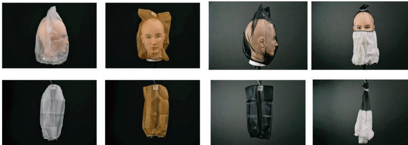
Photo 1 – Spit masks come in a variety of styles and configurations.

liquids exiting and coming in contact with others. This type of spit restraint device has woven mesh construction like the others we examined, but additionally it has the “medical grade fabric” drape sewn to the sack which surrounds and covers the mouth and/or nose areas.