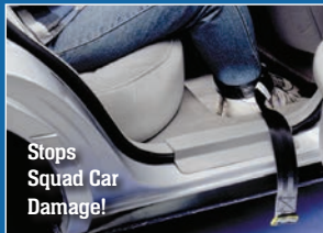
Stops Squad Car Damage!