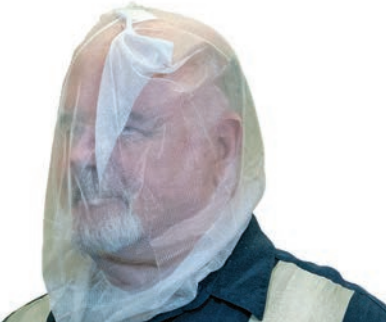
The application of a spit mask over the head of an individual is a use of force.

ven mesh of spit masks which use this design. If a person can breathe through the woven mesh, then his (or her) breath can pass through it, too. Know the design specifications of the spit mask your agency provides and know its limitations and efficacy in preventing aerosolized droplets or spittle from penetrating it. Regardless of the spit mask design, droplets of oral, nasal or blood often become attached to the spit mask, thereby requiring the use of Personal Protection Equipment (PPE), such as gloves, to remove, store and/or properly discard the single-use spit mask per biohazard protocols.